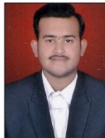
NAVAL JADHAO Youth Festival