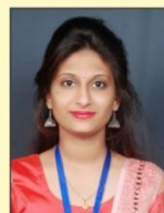
KU.PURVA DESHMUKH YOUTH FESTIVAL