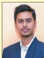
ANAND BORATNE YOUTH FESTIVAL