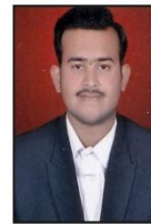
NAVAL JADHAO Youth Festival