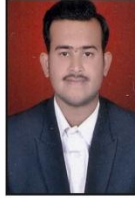
NAVAL JADHAO Youth Festival