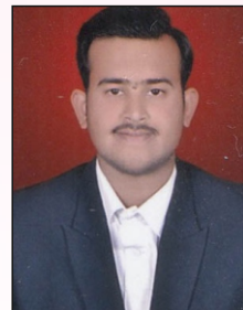
NAVAL JADHAO Youth Festival