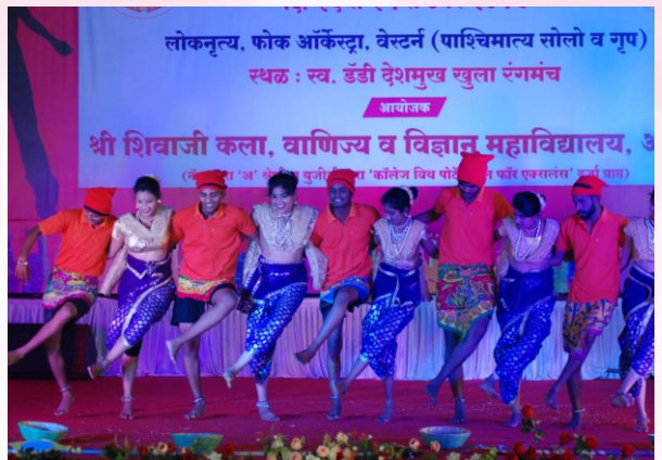
Folk Dance In Sgbau Amravati University Youth Festival