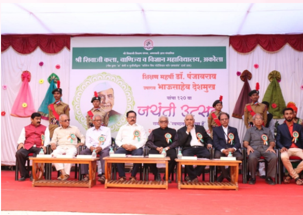
Dr. Panjabrao Deshmukh Jayanti Utsav