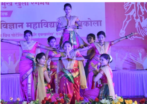
Group Dance In Sgbau Amravati University Youth Festival