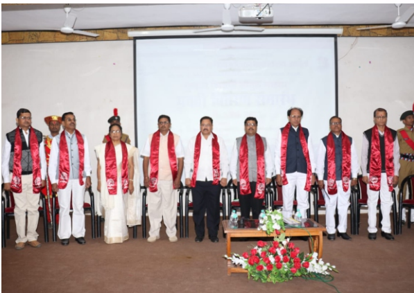
Degree Distribution Ceremony