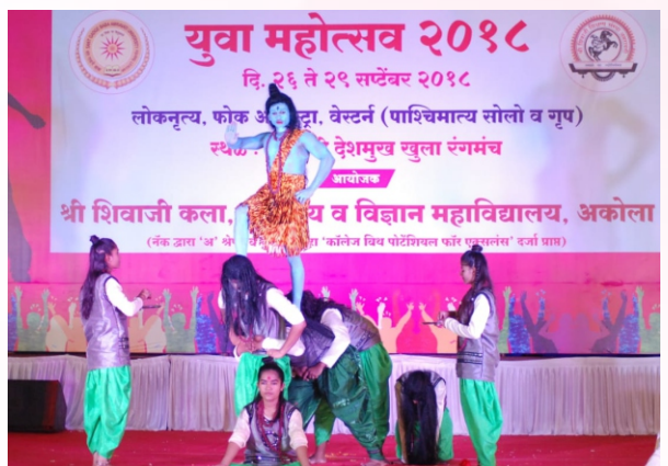
Group Dance In Sgbau Amravati University Youth Festival