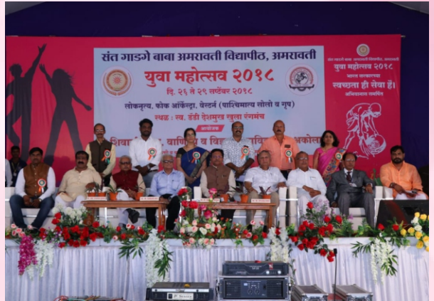
Inaugural Function of SGBAU Amravati University Youth Festival