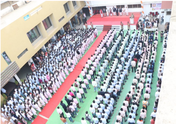
Republic Day -2019