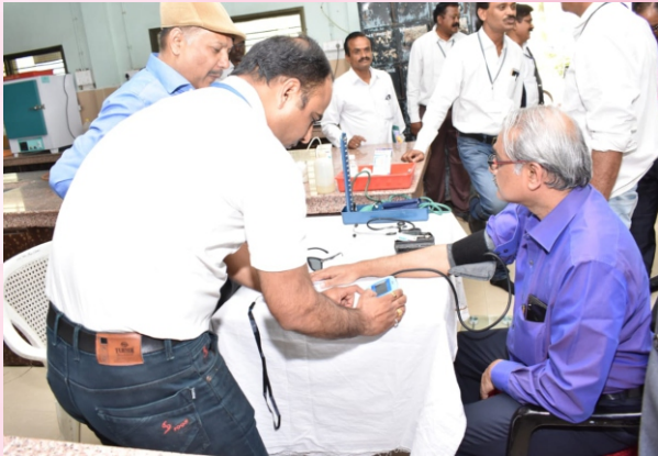
Medical Check up of CPE Peer Team in Bio Chemistry Department