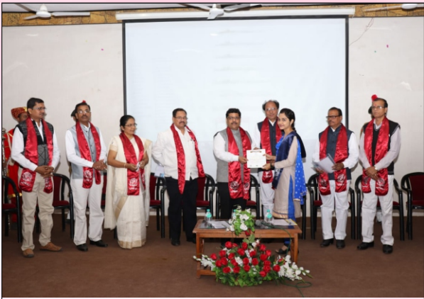
Degree Distribution Ceremony.