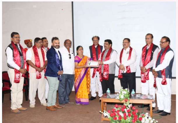
Degree Distribution Ceremony at the hands of Pro-V.C.