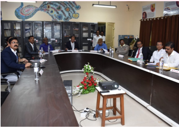
Meeting with Peer Team For CPE