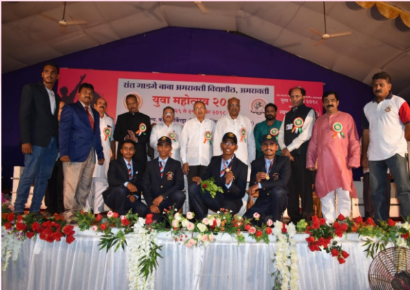
Prize Distribution Ceremony of Sgbau Amravati University Youth Festival