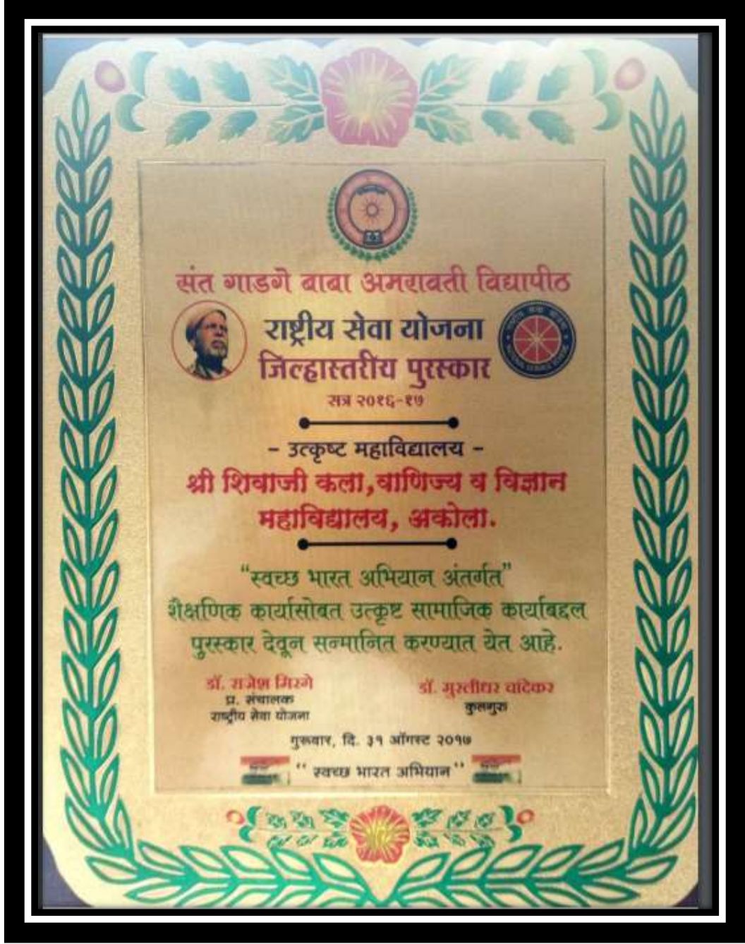
District Level Award for work done under “Swacch Bharat Abhiyan” during 2016-17 by Sand Gadge Baba Amravati University, Amravati (MS)