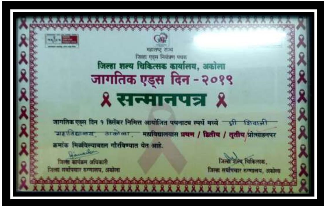
Certificate of Appreciation to the college for participation of Unit in Street Play organized by Government Hospital and Medical College, Akola on the occasion of World AIDS Day 1 st December 2019.