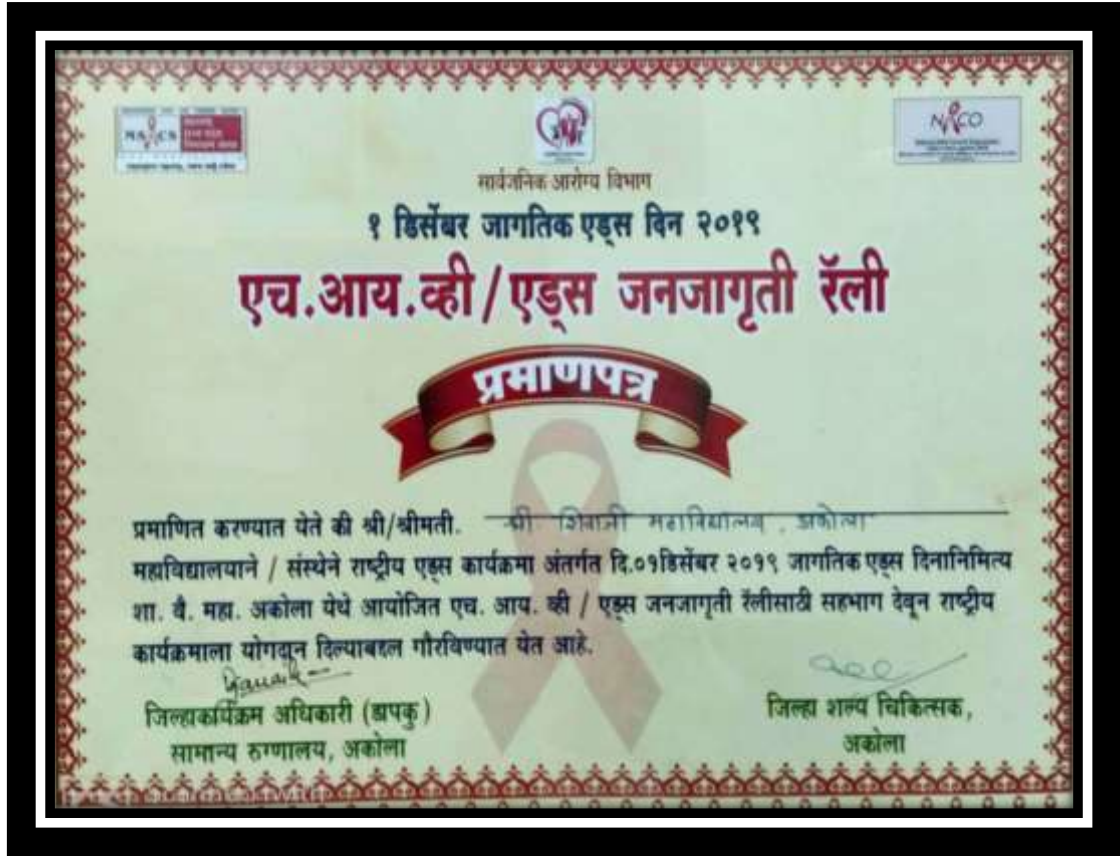
Certificate of Participation in AIDS Awareness Rally (2019)