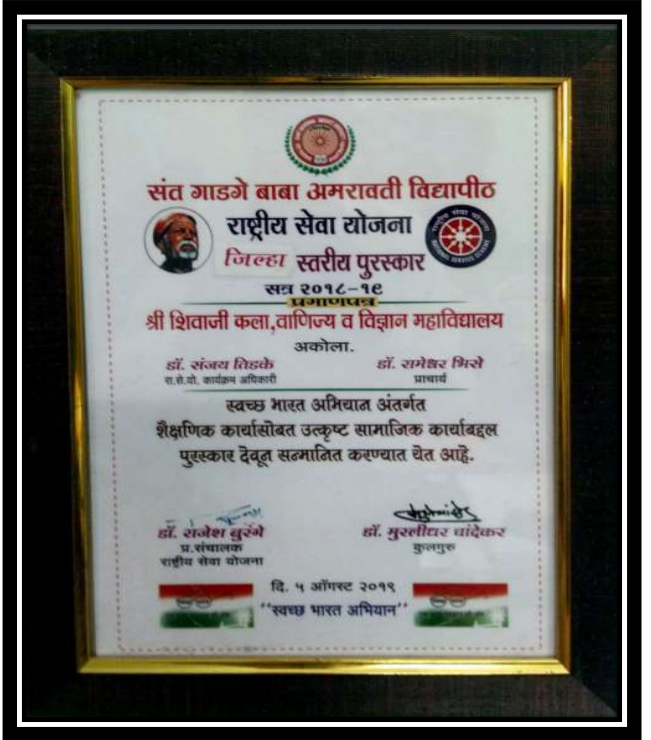
District Level Award for work done under "Swacch Bharat Abhiyan" during 2018-19 by Sand Gadge Baba Amravati University, Amravati (MS)