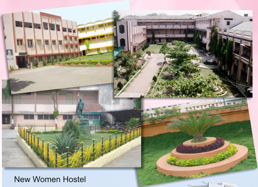
New Women Hostel