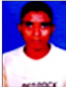
Anand L. Khedkar Swimming & Athletics