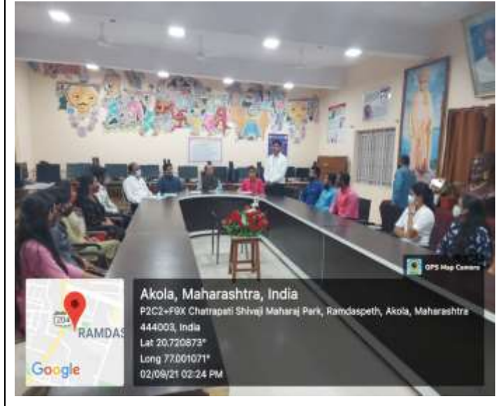
Selected Students in Campus Placement Drive