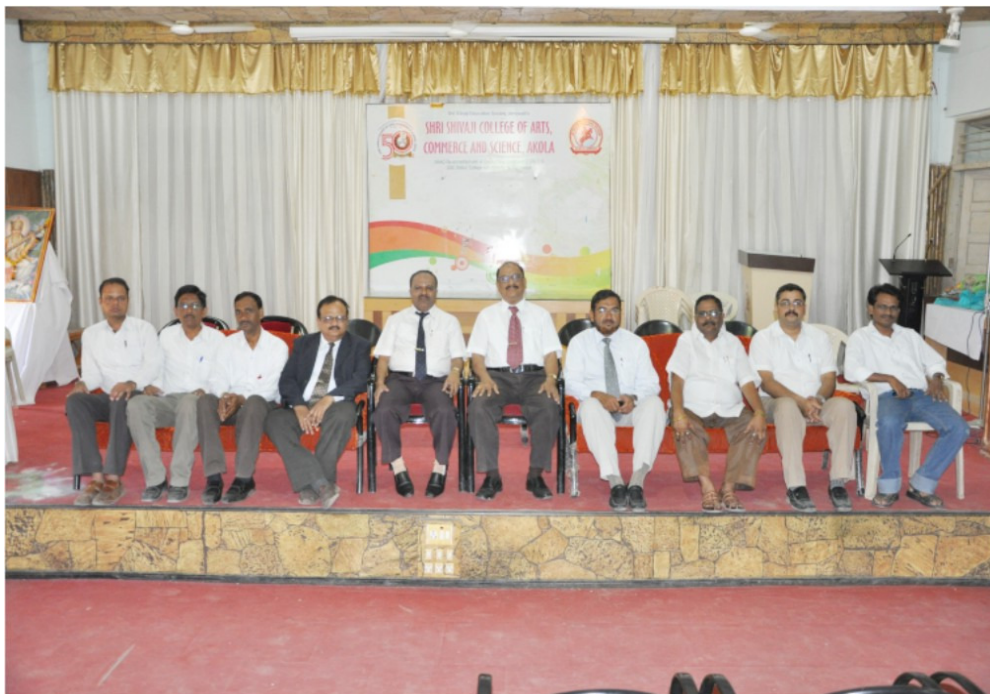
Principle Investigators of Major Research Projects