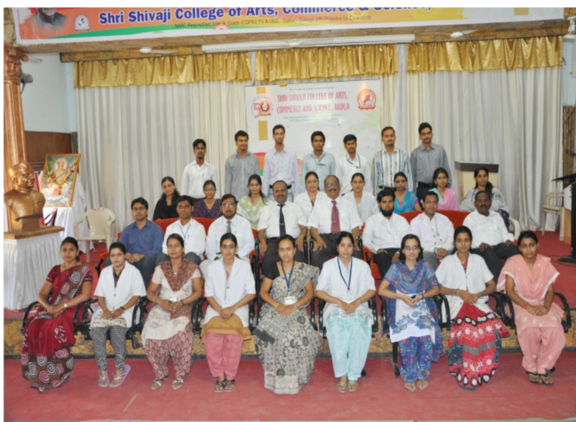
Research Fellows with Principal, Vice-Principal & Coordinator RAC