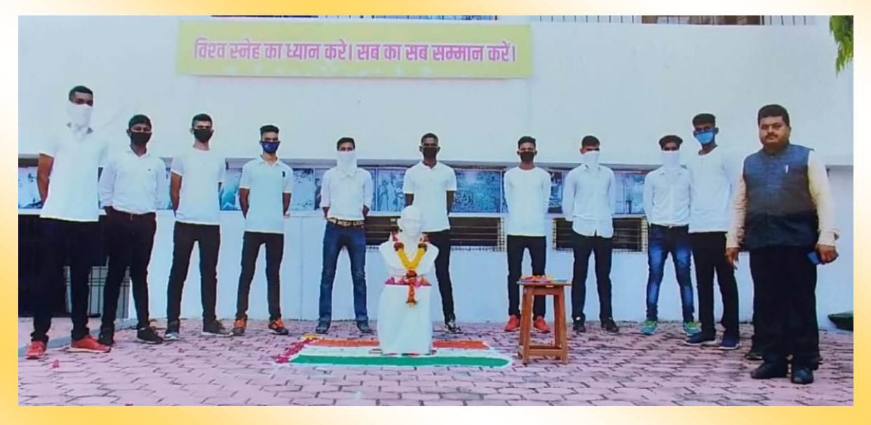
9<sup>th</sup> August 2021 Kranti Din Programme