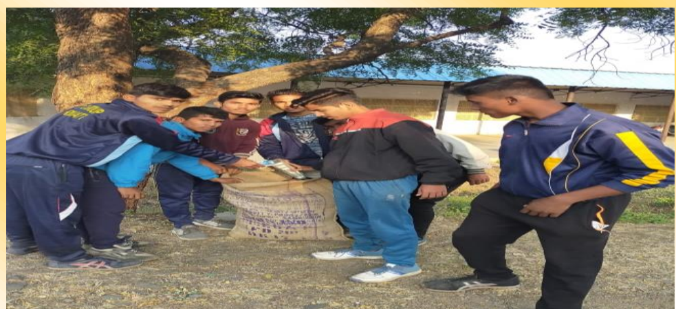
'Plastic se Raksha, Swachhta hi Suraksha' NCC cadets spreading awareness at PKDV 2019 on banning of plastic for the conservation of environment.