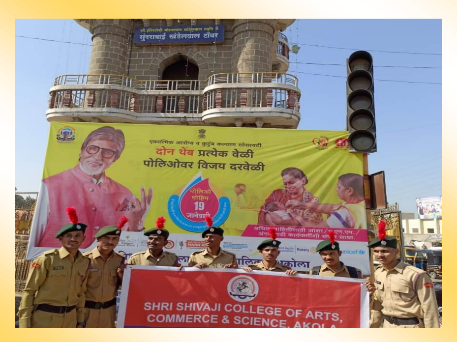
Awareness programme on Pulse Polio Immunization 2019 by NCC cadets