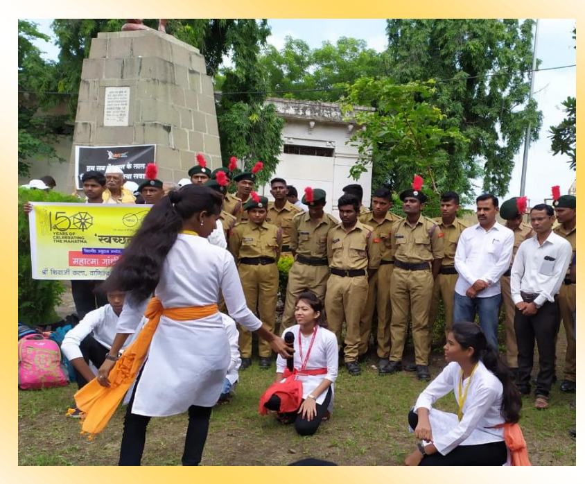
NCC cadets participated in street play on 'AIDS AWARENESS 'on 01/12/2019