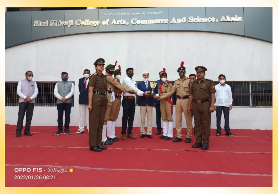
NCC Unit won 1<sup>st</sup> prize in intercollege guard competition on Republic Day 26<sup>th</sup> January 2022