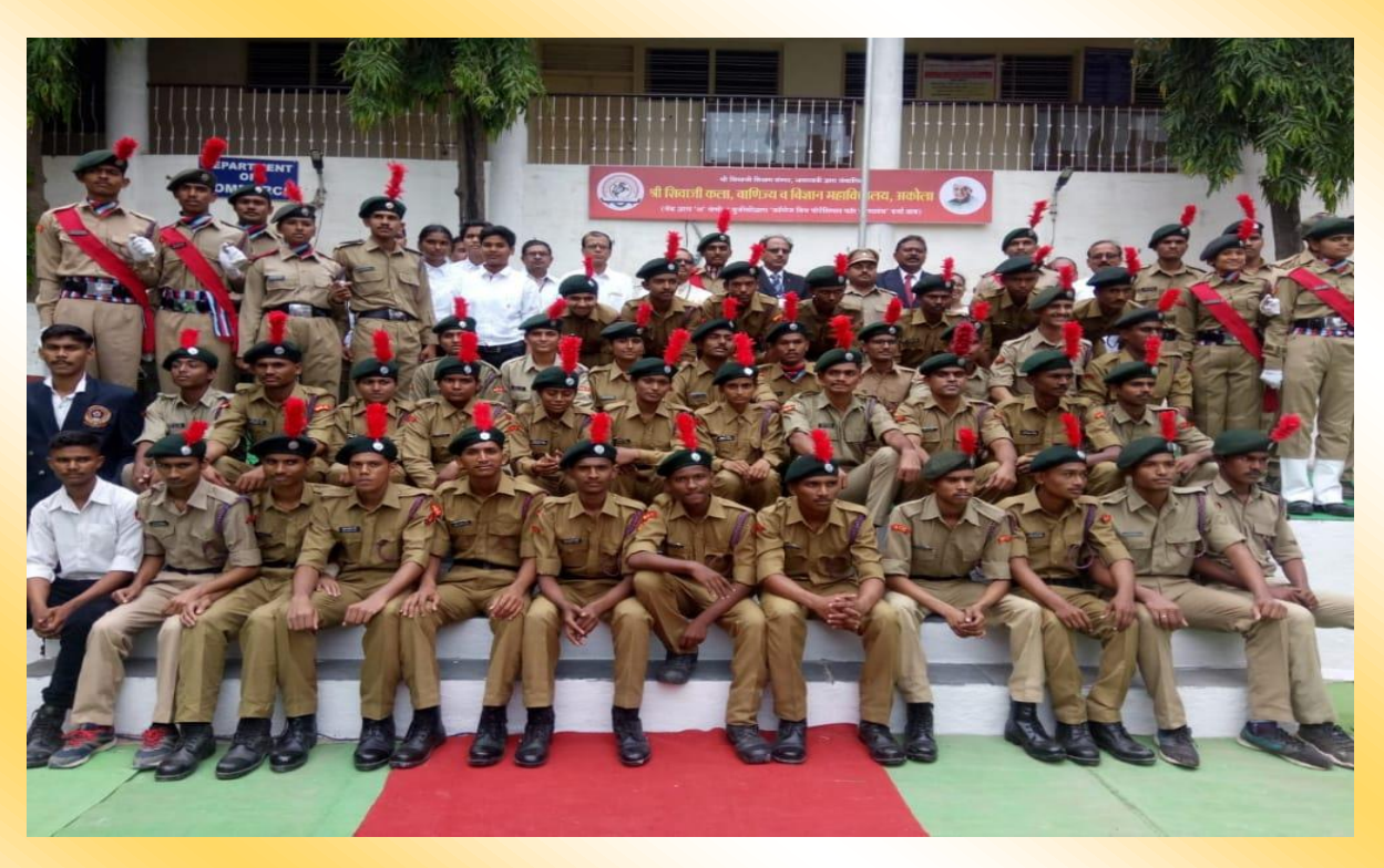
NCC unit on Independence Day celebration 15/08/2018