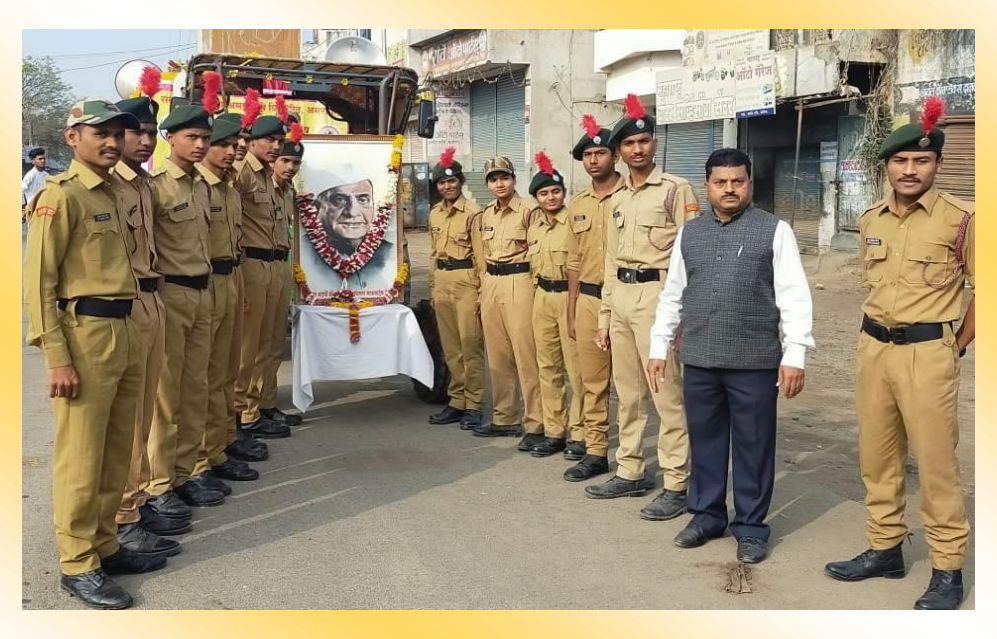
NCC cadets organized Cleanliness Awareness Rally on the occasion of birth anniversary of Dr Punjabrao Deshmukh 27<sup>th</sup> Dec 2019