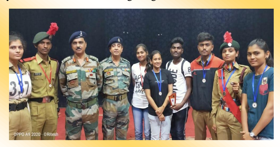
NCC cadets awarded with medals in various events in CATC Camp at PKDV Akola 2019