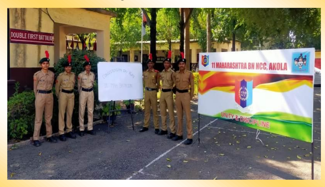
Celebration of Constitution Day at by NCC cadets at 11 MH BT Akola on 17/11/2020