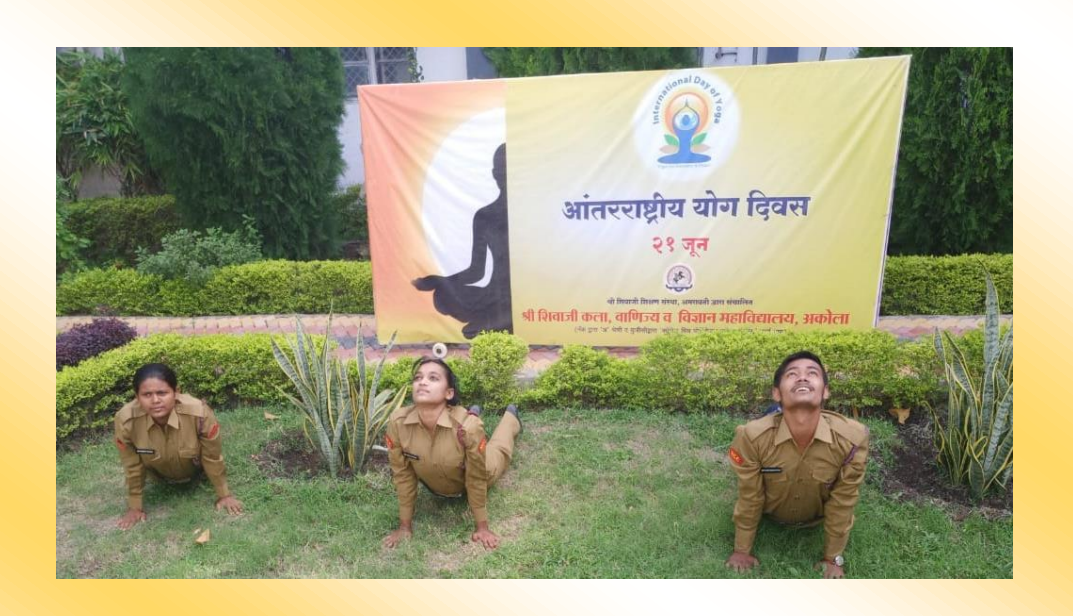
Celebration of Yoga Day