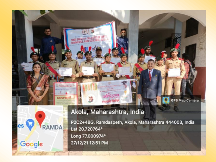
NCC cadets participated in Blood donation campaign Year 2021