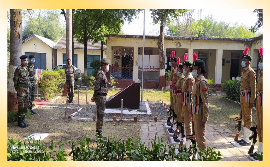
Pre-RDC Training of cadets at 11 MH BT Akola 2020