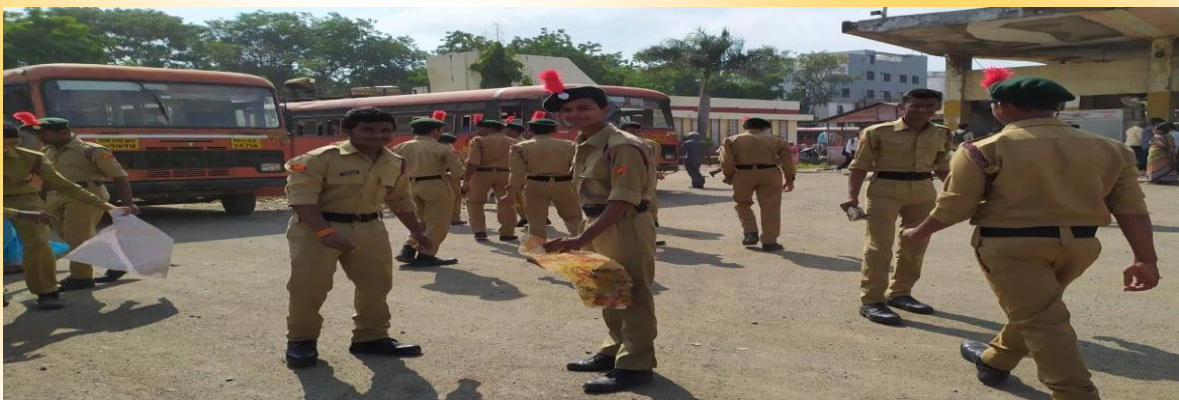
NCC cadets actively participated and spread the awareness about Swachhta Abhiyan and observed Swachhta Pandharwada by cleaning the bus stand of Akola on 02/10/2019