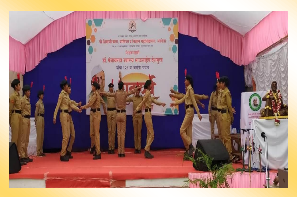
Performance of NCC cadets in the cultural activity programme on the occasion of Dr Punjabrao Deshmukh Jayanti 2019