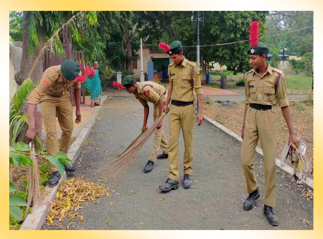
Shramdan &Swachhta Abhiyan by NCC cadets at Shivaji Park on 13/12/2020