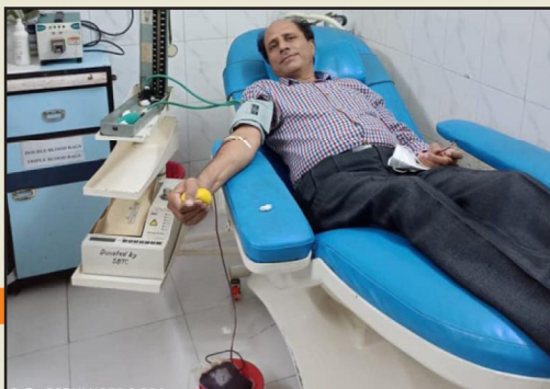
Blood Donation by Hon. Principal