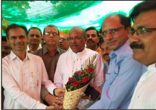
Felicitation of Hon. Central Minister of State of Education