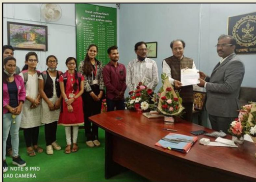
Felicitation of Residence Dy. Collector for his Social Service