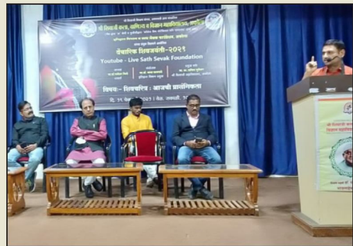
SHIV JAYANTI 2021