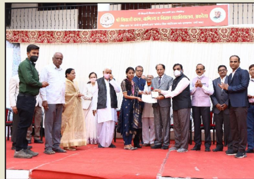
Distribution of Scholarship to Meritorious Students Sponsored by Teachers, on Republic Day