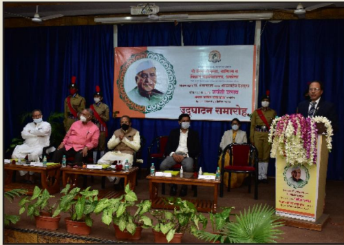
Dr. Panjabrao Deshmukh Jayanti Utsav