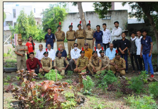
Tree Plantation By NCC Cadets