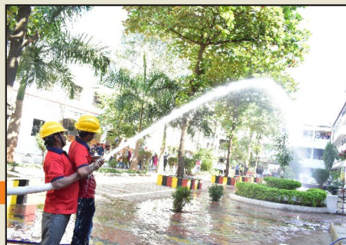
Fire Extinguisher Facility