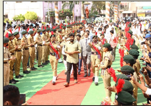
Educational Visit by Guardian Minister Akola