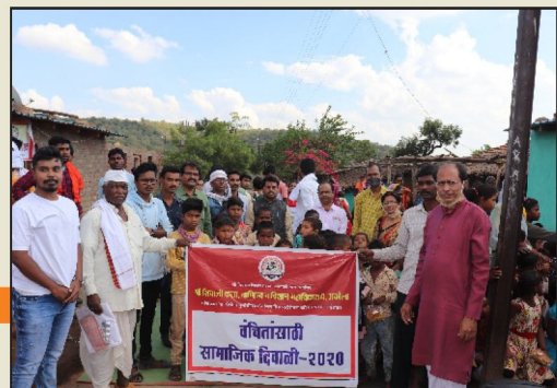
Social Diwali at Khirpani (Tribal Region)