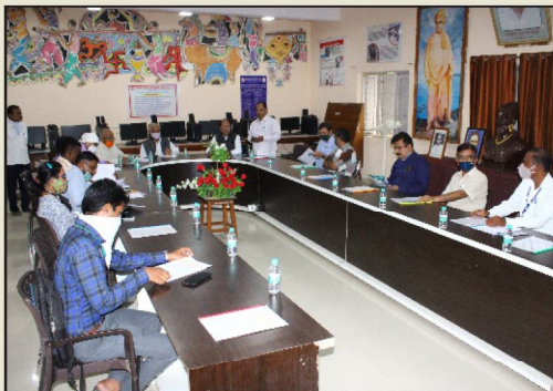
Press Conference Regarding Innovation Research Activities in College