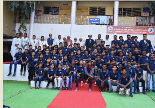
NSS Team of College