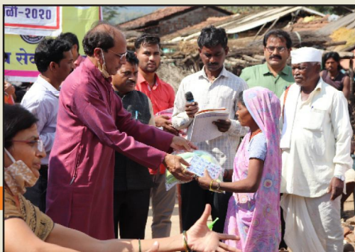
Social Diwali at Khirpani Distribution of Cloths and Food to tribals