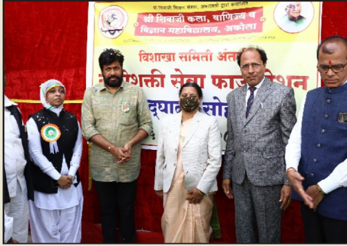
Inauguration Nari Shakti Foundation By Vishakha Samiti of College