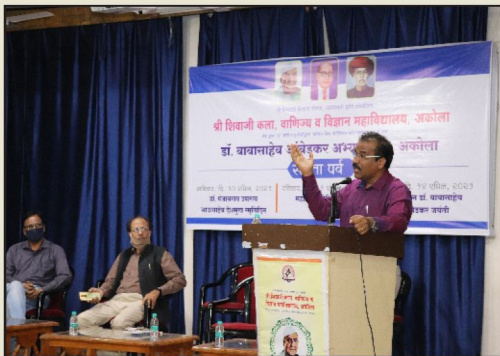
SAMTA PARV 10-14 APRIL 21