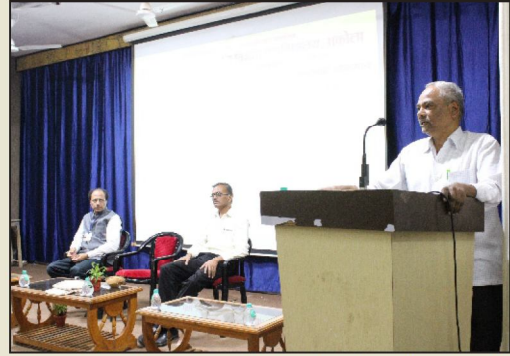
Speech on Sanvidhan Prastavika By Hon' Shri. Sheshrao Khade