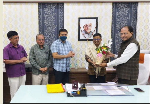
Visit of Municipal Commissioner at College