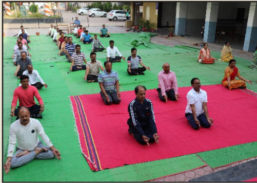
Yoga Day - 2021