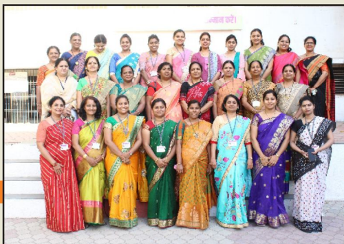
Womens' day Celebration