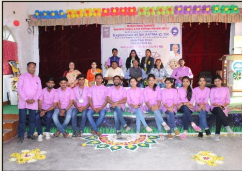
An International Conference On Exploration of 29. Mahatma Gandhi 150th birth Anniversary