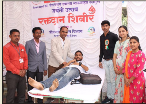
Blood Donation Camp(121 Bags)