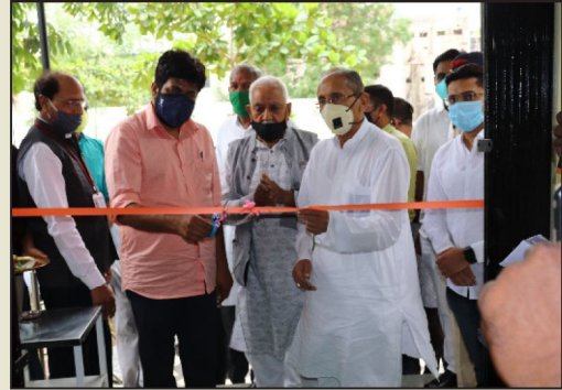
Covid Centre Innuagation