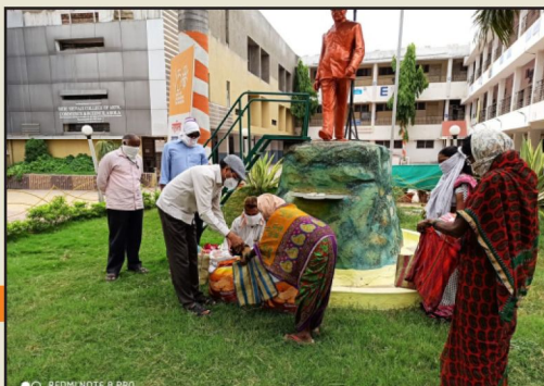
Food Grains to Poor Section of Society