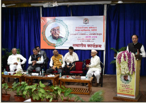
Dr. Panjabrao Deshmukh Jayanti Utsav