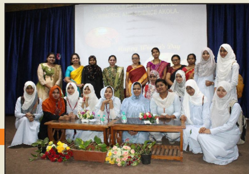
Womens' day Celebration