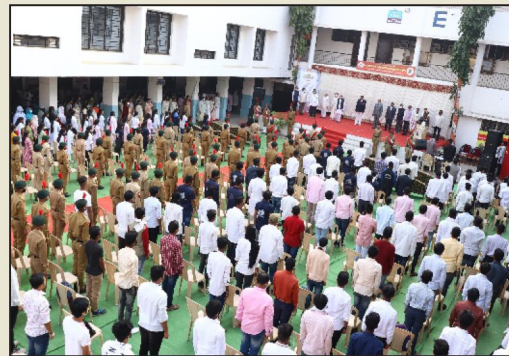
Republic Day 2021 (By Social Distancing)