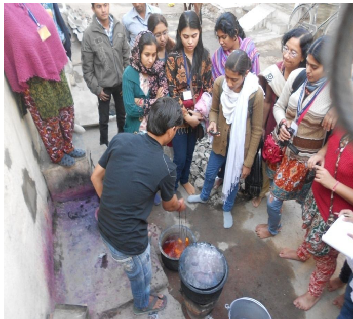
Workshop on Dyeing and Printing