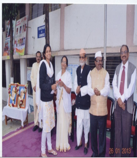
Merit Student of Summer exam 2012