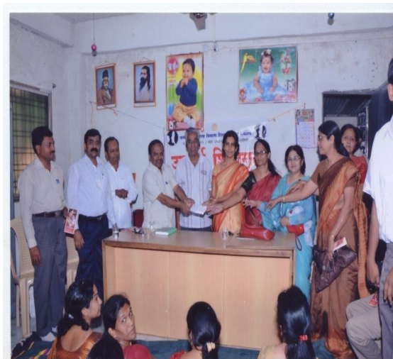
Donation given to Utkarsha shishu gruh-Malkapur