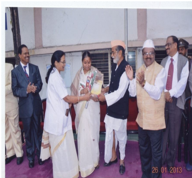
Best non teaching award-2012 bagged by Department