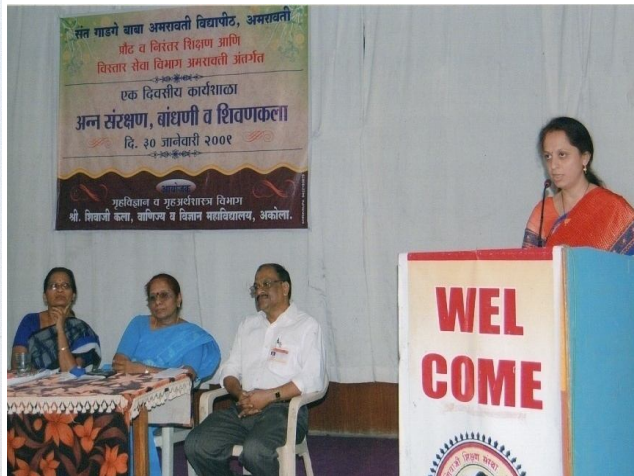
One Day Work shop on Skill Development