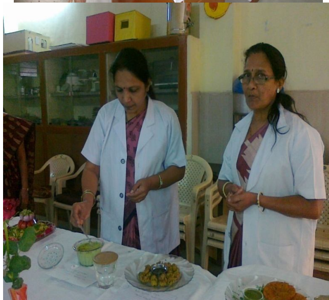
Competitions held in Nutrition week