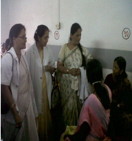
Health & Nutritional guidance to patients at Government Hospital