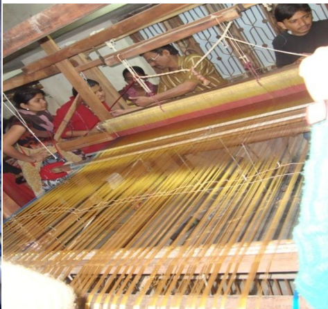
Student's visit at weaving center