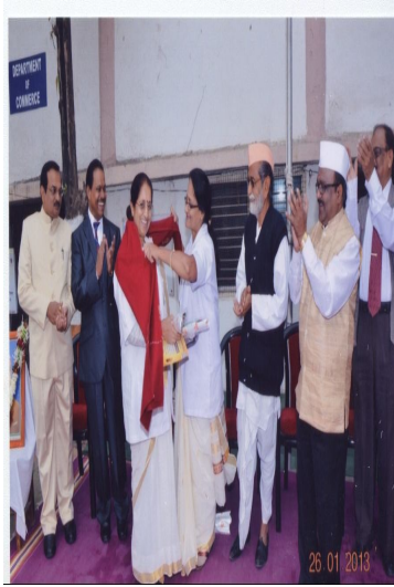
Best Teacher Award 2012-2013