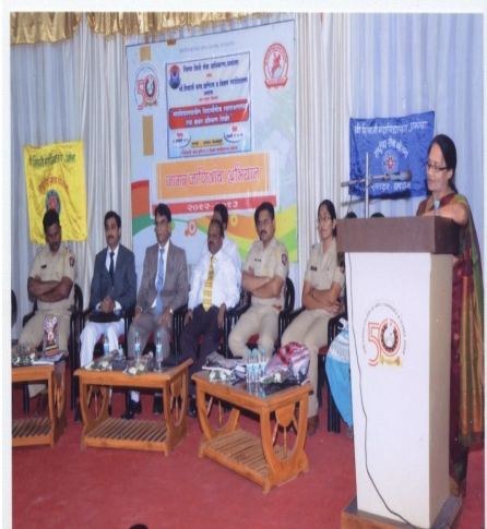
One Day Work shop on Self Defence