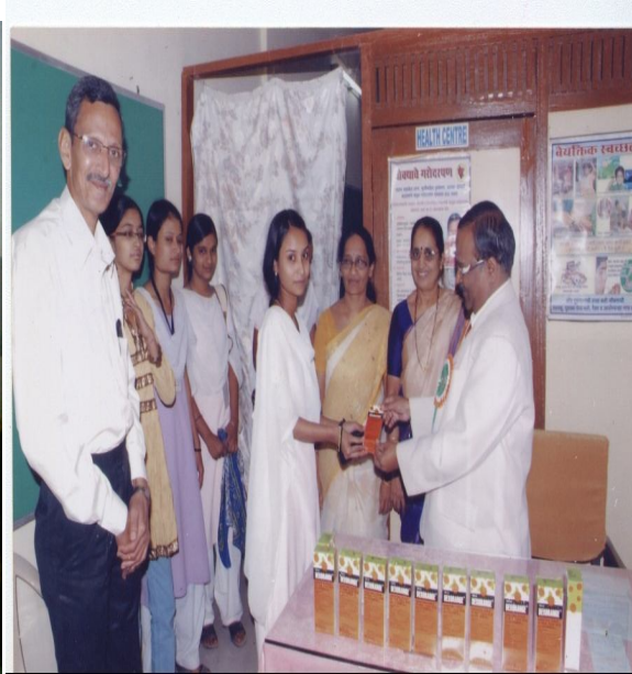
Distribution of Medicines