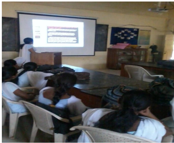
Students engaged in Seminar ( Power Point Presentation)