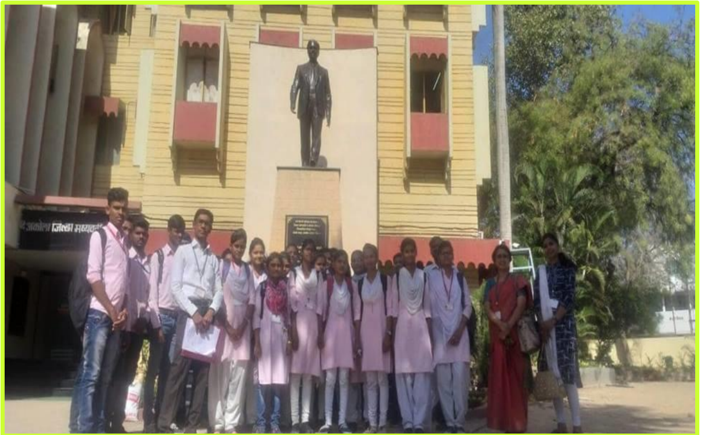
Department Visit to Akola District Central Co-operative Bank, Akola Dt.5 March 2019