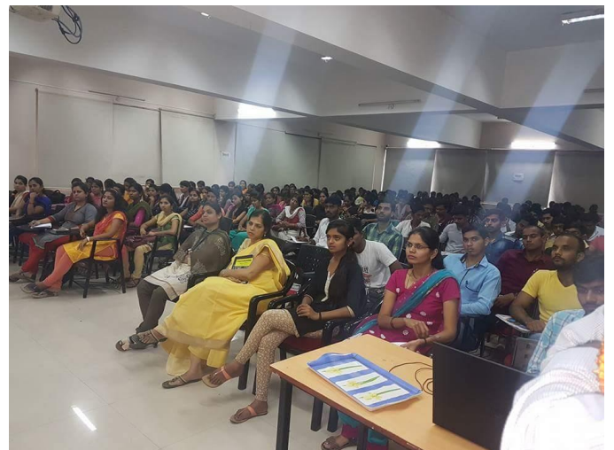
Delivered lecture on BANK TRANSACTION TAX-BTT at Mahila Mahavidyalaya, Nagpur, Dt.4 Oct. 2016.